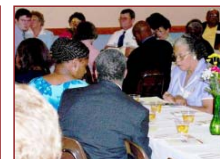
Guests gathered at the DVD Premiere.