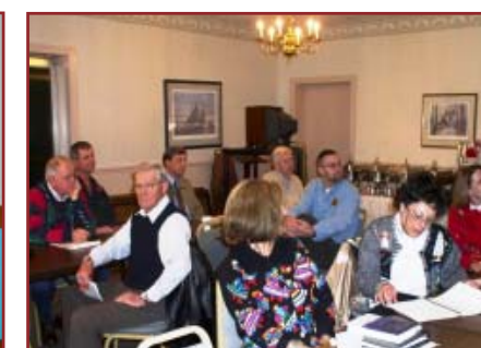
Council and visitors at a board meeting.