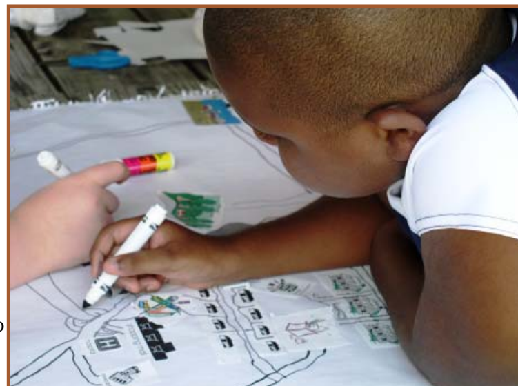
Field School student helps his team design a watershed community.