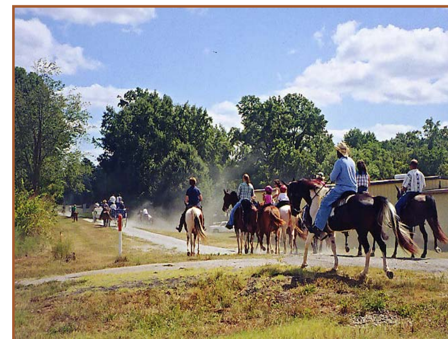
Horse enthusiasts enjoy a trail ride along a converted railbed.